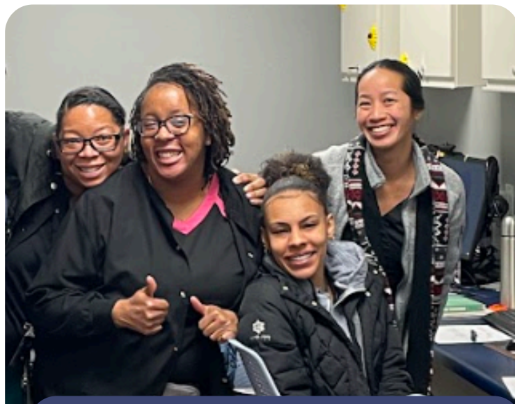
The dental team takes a well-deserved break at the Coalition's Champa location

When someone walks into the Coalition's dental clinics, common problems include emergency pain and swelling associated with infected teeth, gum disease, infections, broken teeth and cavities, missing teeth, and lost dentures. That is when our dental team works together to address their needs.