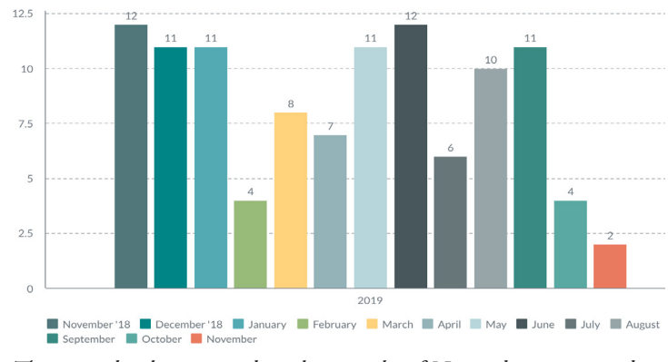
The most deaths occurred in the months of November 2018 and June 2019, accounting for 12 deaths each.

percent (10%) of deaths were related to environmental exposure, the majority of which were from hypothermia or complications due to illness in combination with exposure to cold environments.