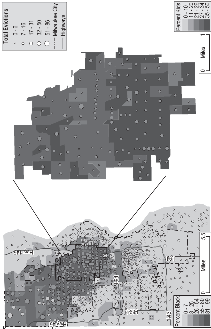
Figure 1. Milwaukee Neighborhood Evictions by Percent Black and Percent Children