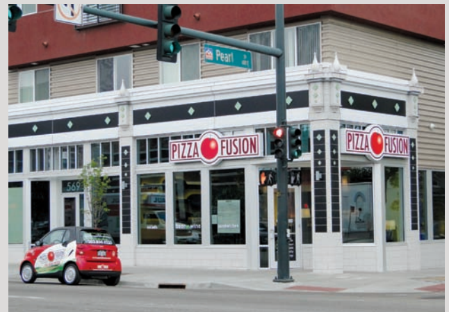
The Coalition now owns and operates Pizza Fusion at the Renaissance Uptown Lofts, providing on-the-job training for homeless individuals.

The Coalition utilized creative, multi-level and leveraged financing techniques that included a combination of federal tax credits, funding from state and local governments, private