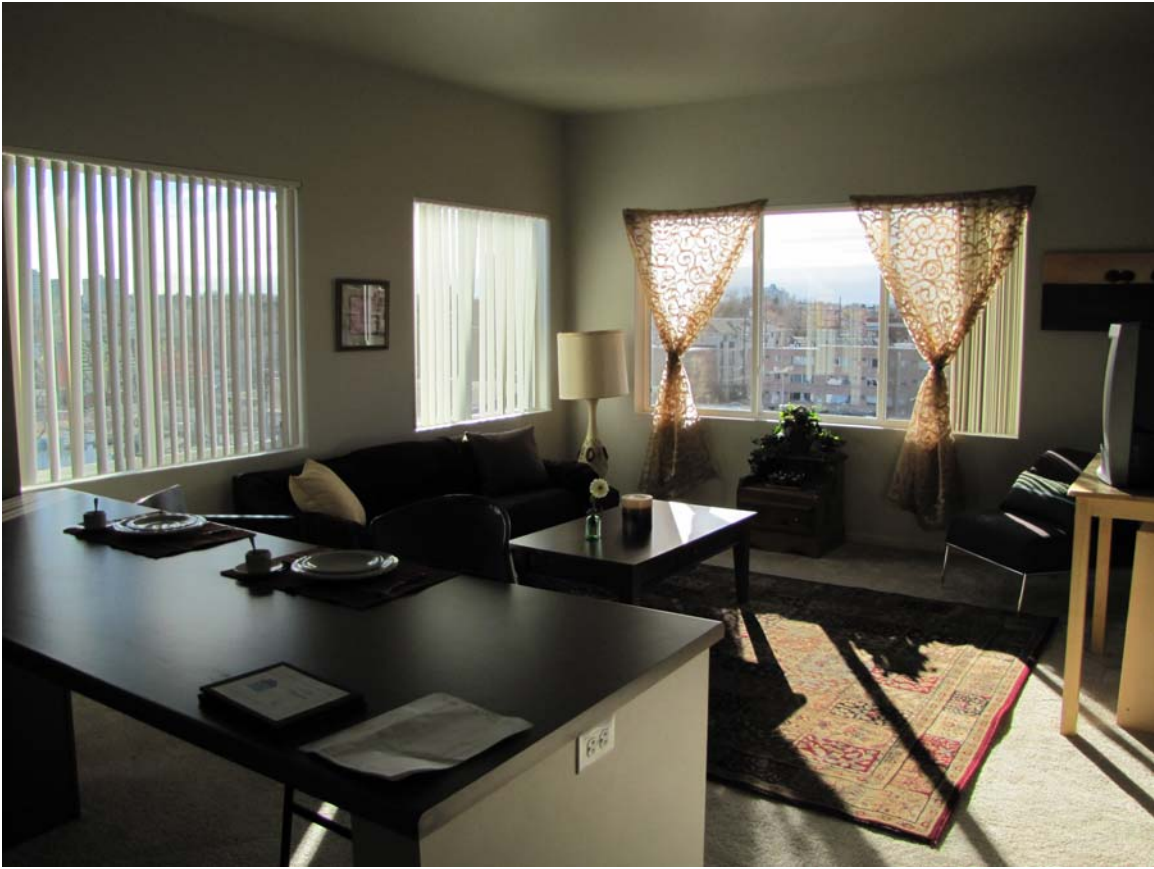
Typical Unit furnished by Adopt a Home Campaign