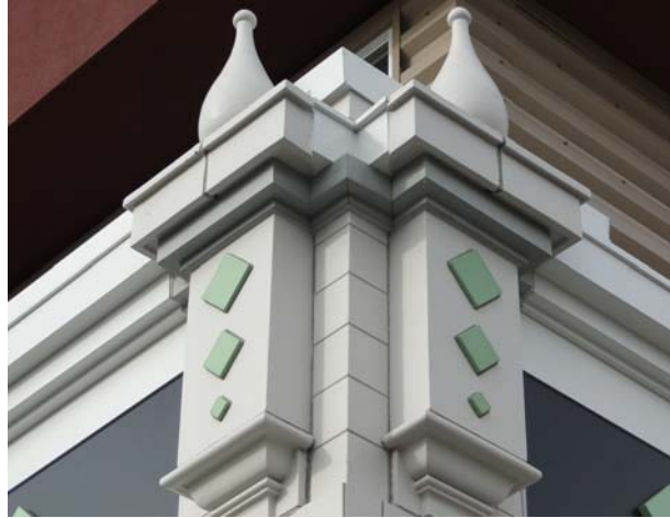
Re-constructed Building Façade with Ornamental Finials