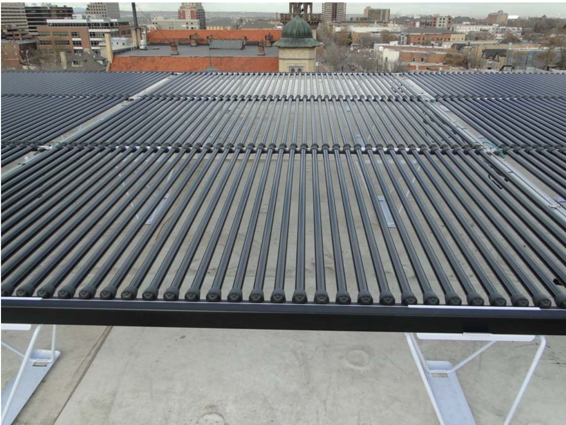
320 Solyndra tubular PV solar collectors generate 30% more electricity