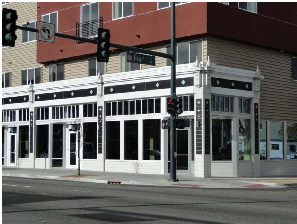
New Retail Façade (close-up)