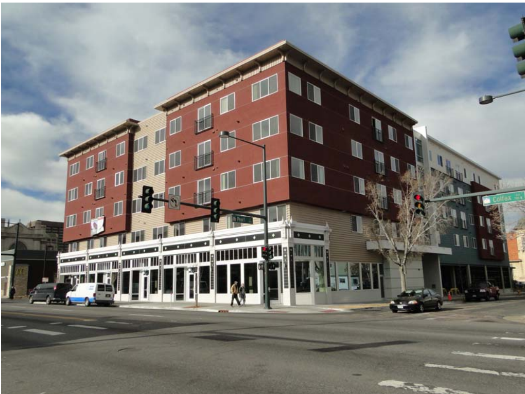
New Retail Facade