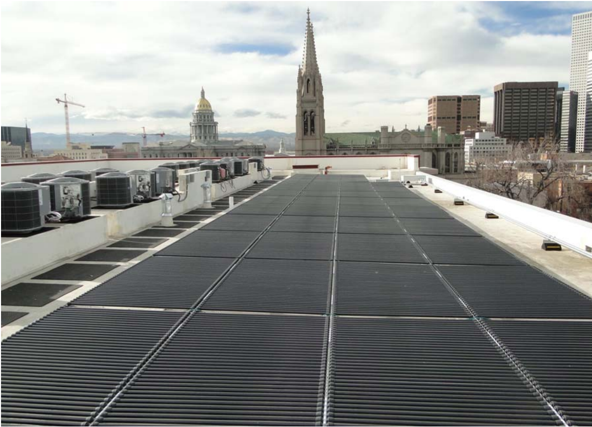
Rooftop Solar Panels and High Energy AC Condensers