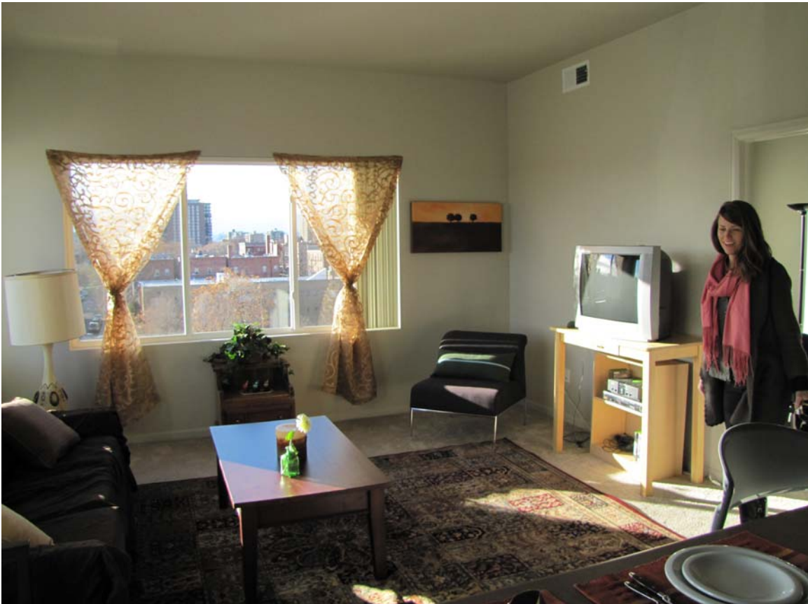
Typical Unit furnished by Adopt a Home Campaign