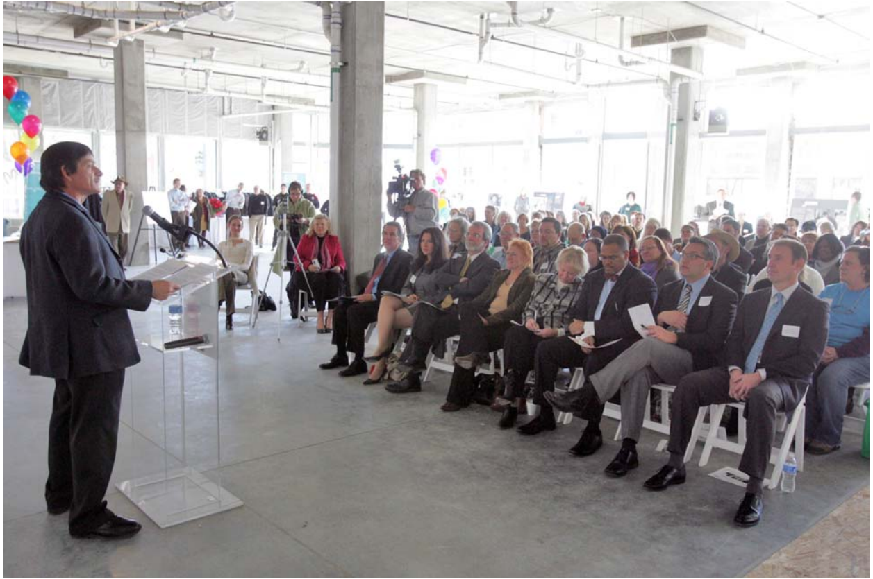
Grand Opening Event in Retail Space