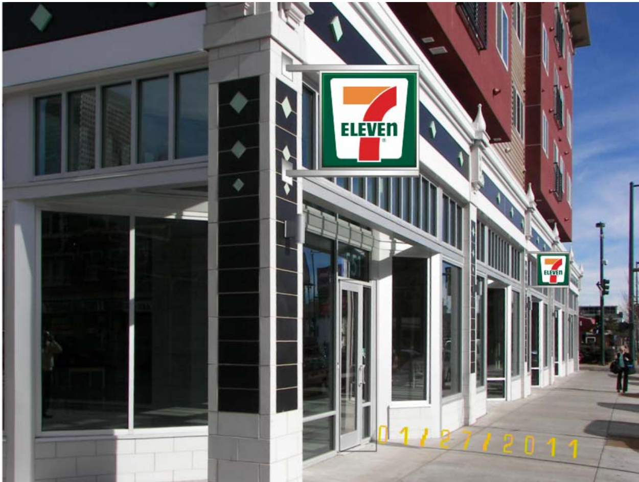
New Urban Style Seven-Eleven Convenience Store