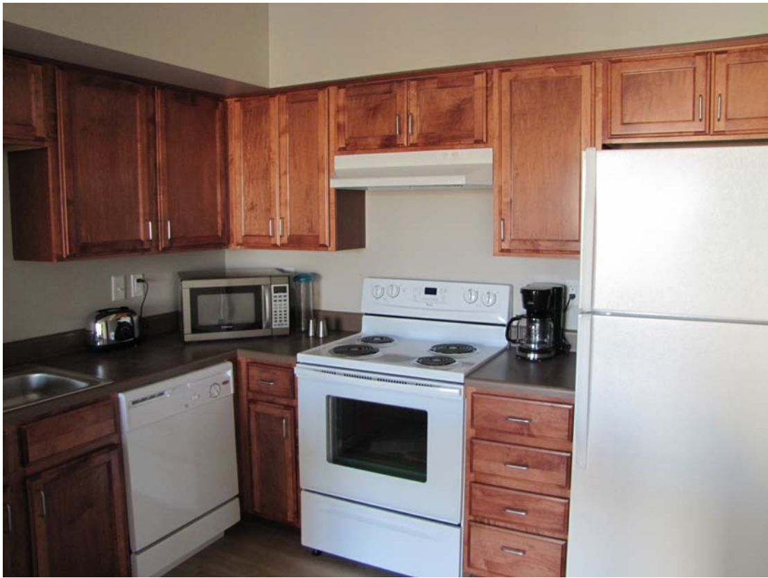
Kitchen Type 1