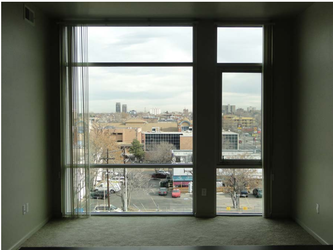
Floor to Ceiling Windows in Select Unit