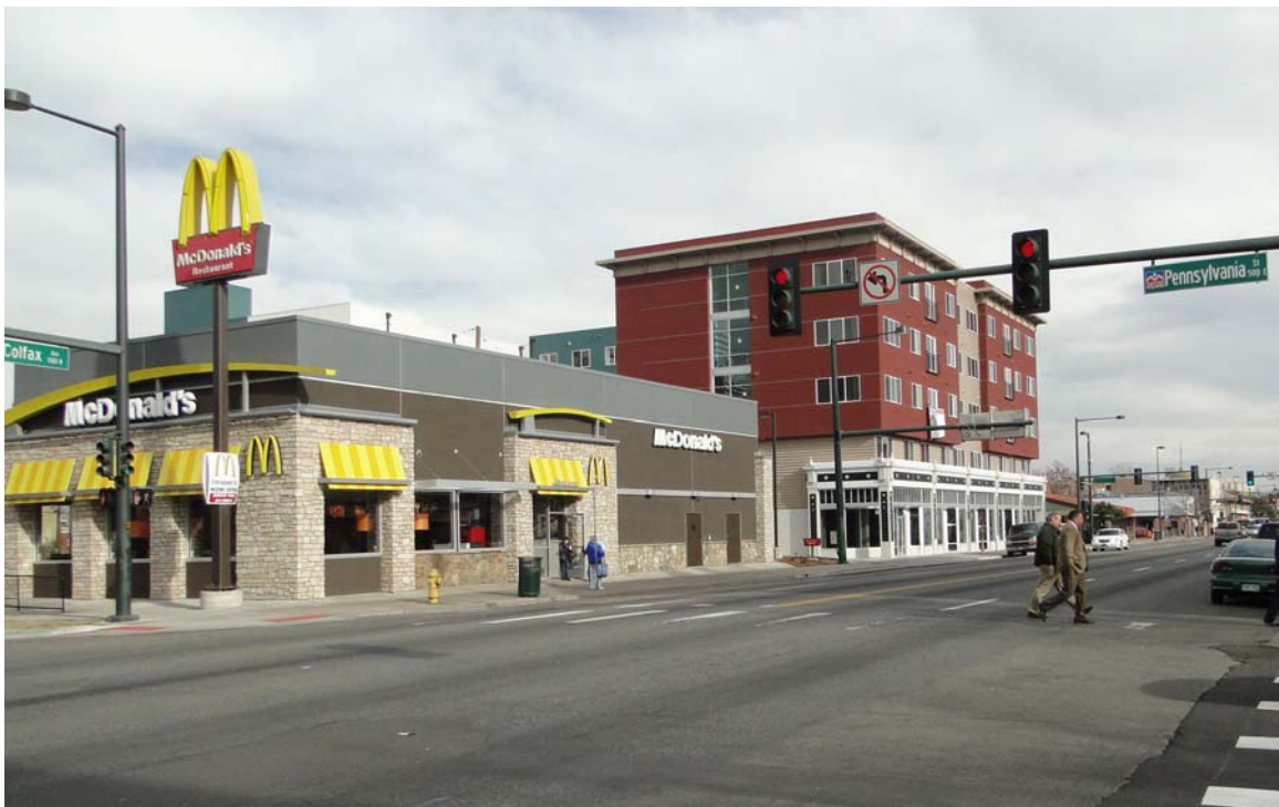
Adjacent Redevelopment of McDonald's