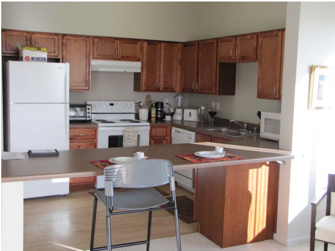
Kitchen Type 2