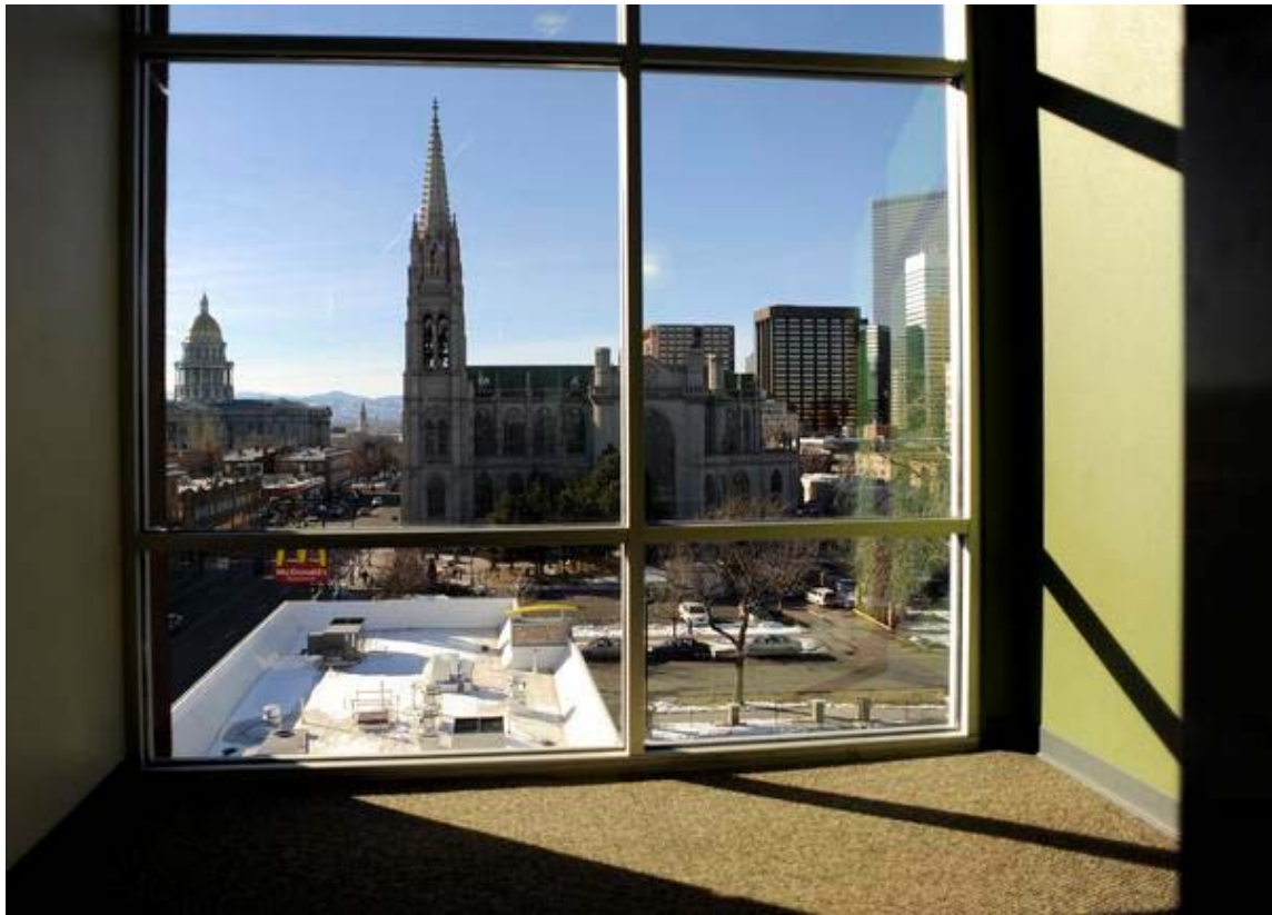
Floor to Ceiling Windows in Corridor, Views of Capital and Cathedral