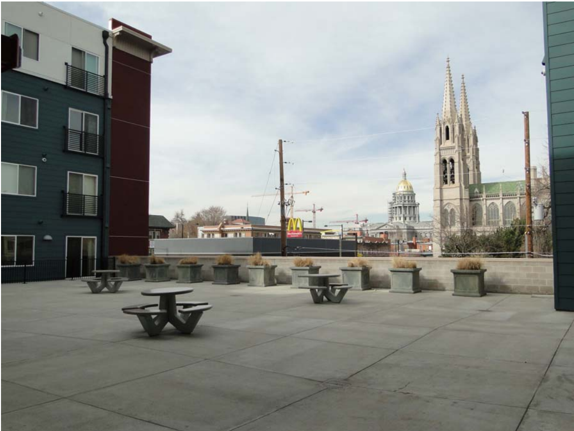
Second Story Community Courtyard