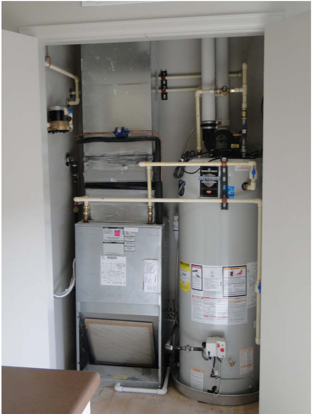
High energy AquaTherm heating/cooling system